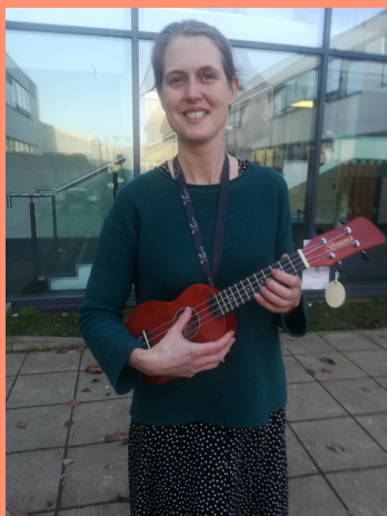
About Millers Music